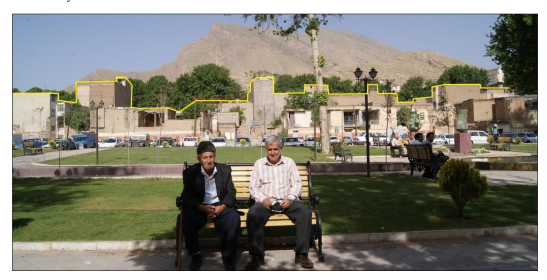
Figure 5. Visual problems of "GAP" Bridge district (By authors)